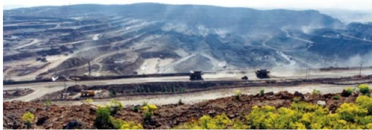
China Coal AnnRpt 2006.