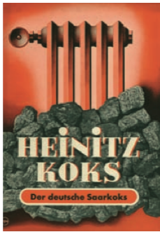
RAG Annual Rpt 2008.