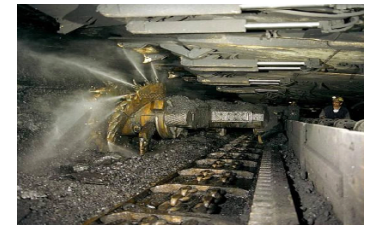
RAG (2009) company brochure.

CMS has not traced the divestiture of RAG International assets in 2004. It is also unclear whether RAG American Coal acquired some or all of the mining interests acquired by PhelpsDodge in 1999 (Cyprus Amax Minerals Company)