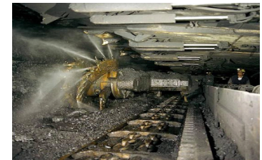
RAG (2009) company brochure.

RAG incorporated in 1968 as Ruhrkohle AG