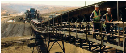
Sasol Annual Report 2010, page 29.