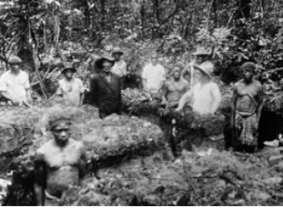
Exploration in Gabon in the 1930s. SNPA discovers Lacq gas field in France in 1951.