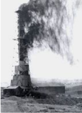
Baba Gurgur 45-meter gusher 15Oct27 near Kirkuk. www.total.com